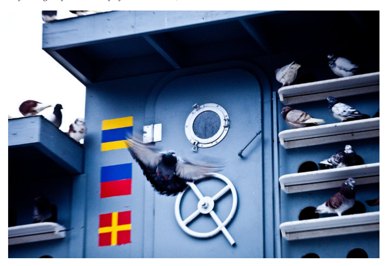
Pigeons aboard the Baylander before the beginning of "Fly by Night."

Anyone, like me, who was expecting Busby Berkeley-like precision was quickly disabused of the notion. (While trainable, pigeons also have minds of their own; some regularly attempted to return to the boat only to be gently shooed away by their handlers.)