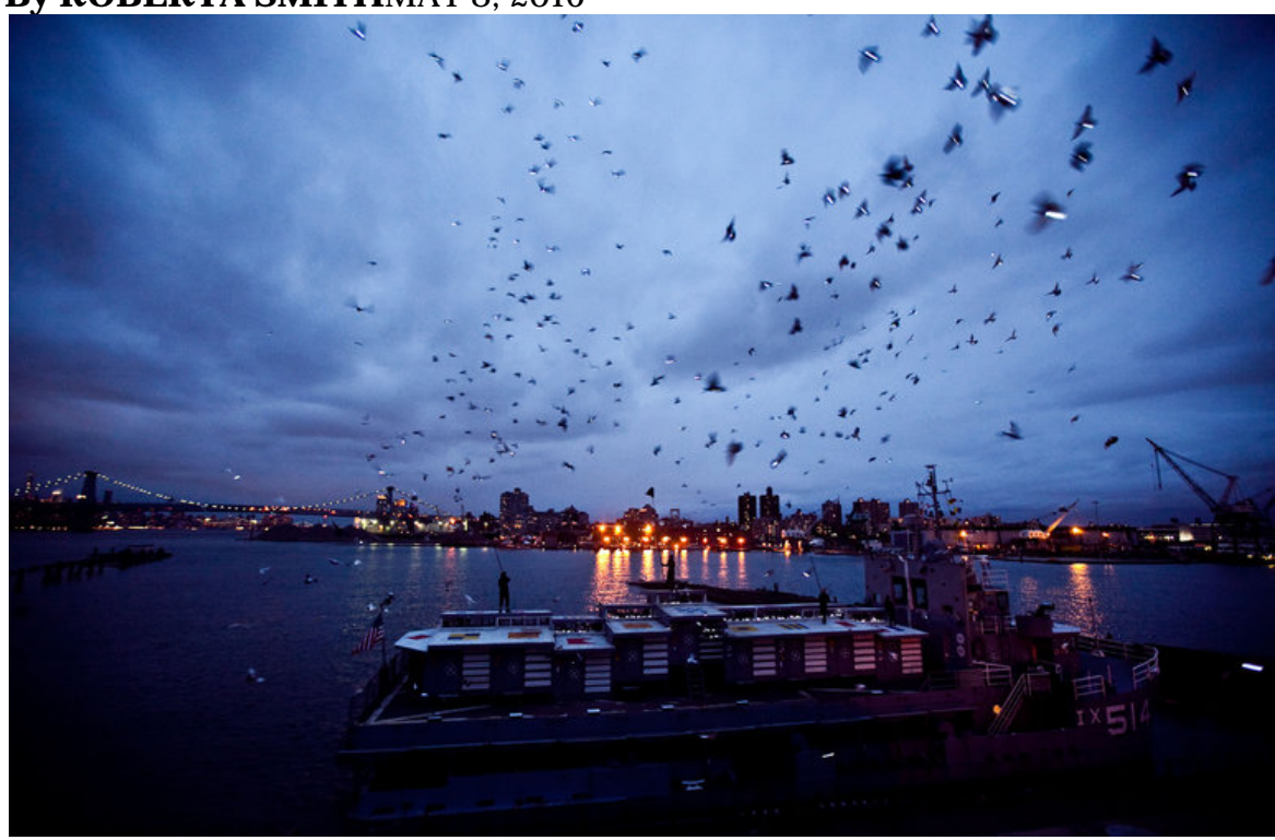
Pigeons outfitted with LED lights soar over the Brooklyn Navy Yard.