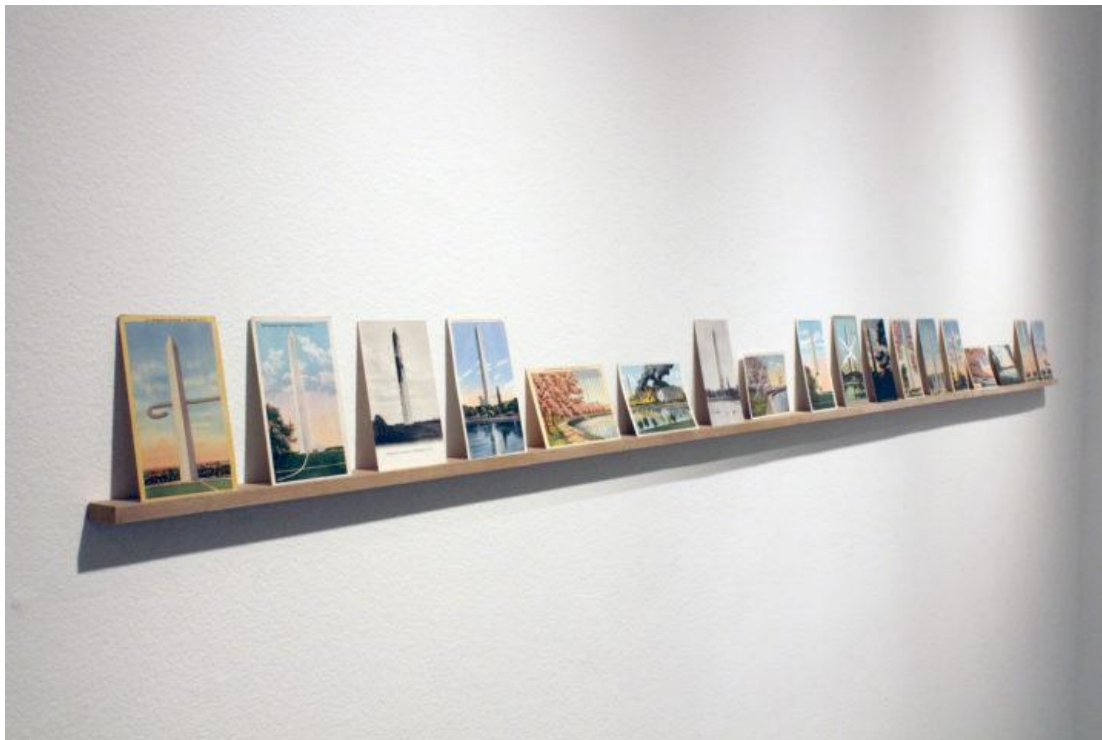
Installation view of 'David Opdyke: Truthful Hyperbole' at Magnan Metz Gallery

521 WEST 26TH STREET NEW YORK CITY 10001 (212) 244-2344 www.MAGNANMETZ.com