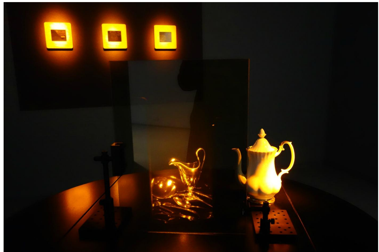
Installation view of Wenyon & Gamble: Out of Place at Magnan Metz Gallery

Wenyon & Gamble regularly use holography to ruminate on outdated technology. Their 2012 exhibition at Magnan Metz — A Universe held up for Inspection (reviewed in Hyperallergic by Ellen Pearlman) — explored the legacy of the analogue photograph. For instance, holograms of wooden glass plate storage boxes. It's interesting that Wenyon & Gamble continue to emphasize that holography, in a way, has more in common with 19th-century photography than that of the 21st century. Daguerreotypes in Out of Place have a similar hands-on process to the holograms, which are animated with 3D images captured through lasers and emulsion on glass.